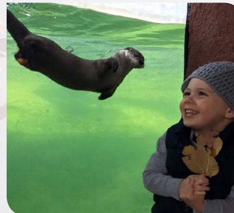
Children's expressions when they see our otters swimming!