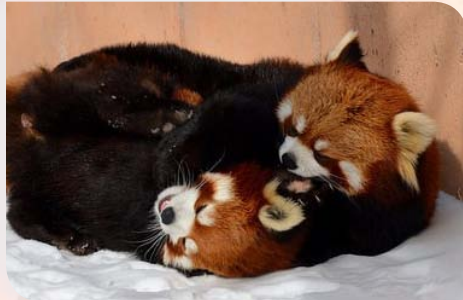
Pandas wrestling in the snow.