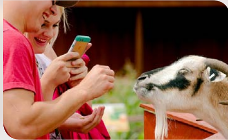
Sharing a smile in the Children's Zoo Farm!