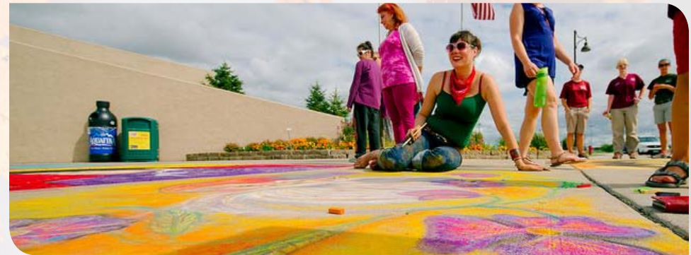
Creating colorful art in the zoo.