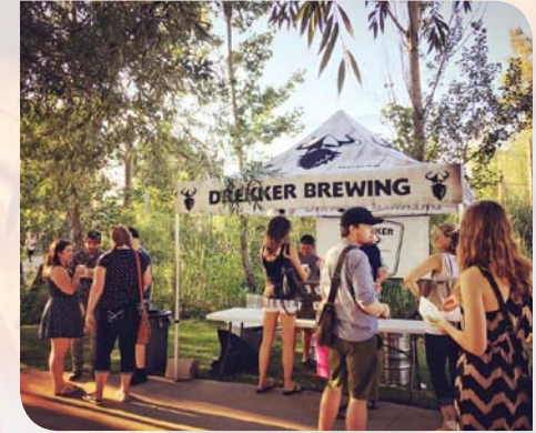
Adults enjoying our first ever Zoo Brew!

Look around there are so many reasons to smile when you are at the zoo! When you visit the Red River Zoo, not only are you having a fun adventure, but you are supporting local, national and international conservation efforts. Send in YOUR reasons to smile to thezoo@redriverzoo.org !