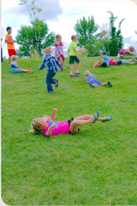
Children rolling down the hill will soon be children sledding down the hill.