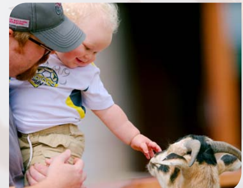
Creating lifelong memories at the Zoo!