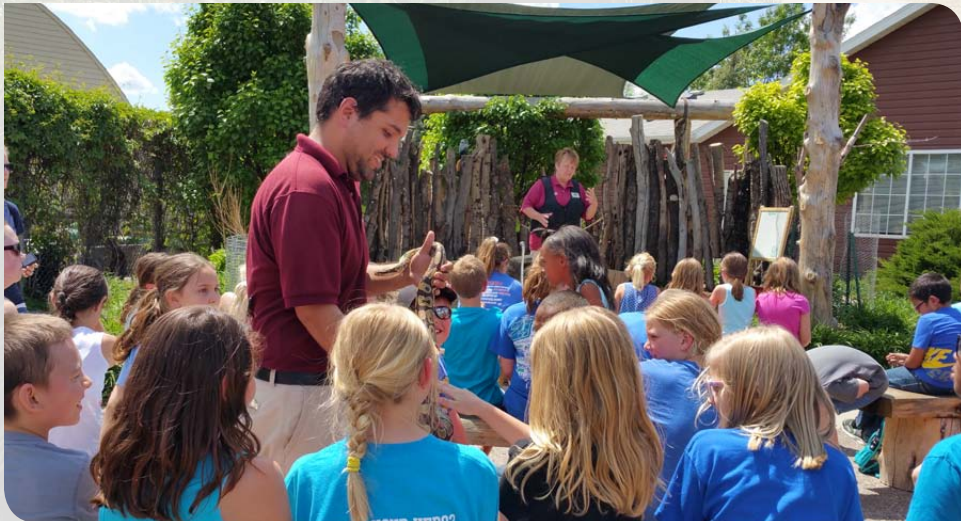
School children enjoying a critter close up.