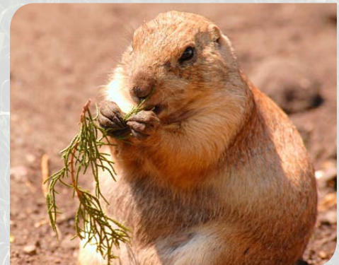
The beautiful spring this year gave us all a jump start on summer fun...including the Prairie Dogs!