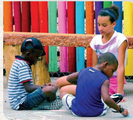
Children creating their own art by the pencil fence.