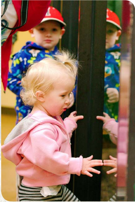
The expression on a child's face when they get an up close view of an armadillo!