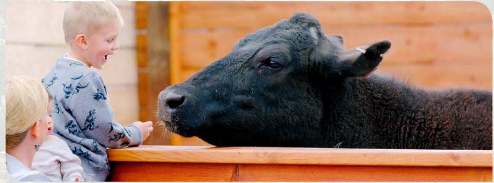
The Children's Zoo Farm is open, delighting both children and adults!