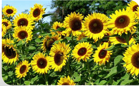
The Children's Zoo Farm gardens are growing, creating a beautiful space for discovery and fun!