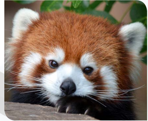
1/4 of the Red Panda's in North America were born right here at the Red River Zoo!

Look around there are so many reasons to smile when you are at the zoo! When you visit the Red River Zoo, not only are you having a fun adventure, but you are supporting local, national and international conservation efforts. Send in YOUR reasons to smile to thezoo@redrivezoo.org !