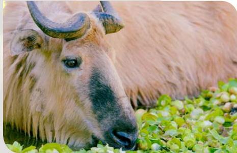
Your membership helps support local and global conservation efforts...now that's a reason to smile!

Look around there are so many reasons to smile when you are at the zoo! When you visit the Red River Zoo, not only are you having a fun adventure, but you are supporting local, national and international conservation efforts. Send in YOUR reasons to smile to thezoo@redrivezoo.org !